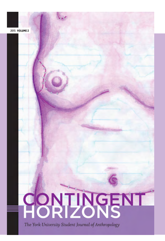
ILLUSTRATION CREDITS Christabel Homewood 95, 104.

Contingent Horizons: The York University Student Journal of Anthropology. 2015. 2(1):89-114.