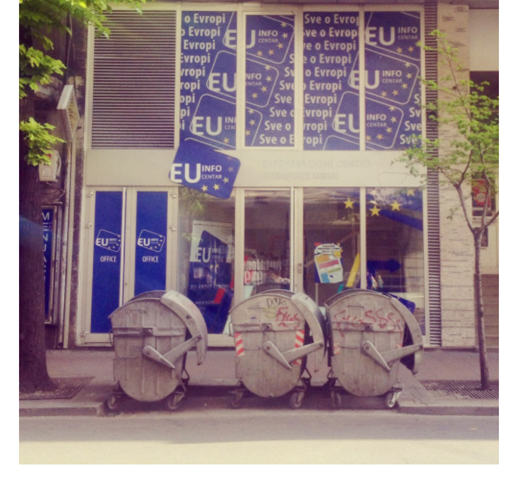
An EU information centre and dumpsters in downtown Belgrade.