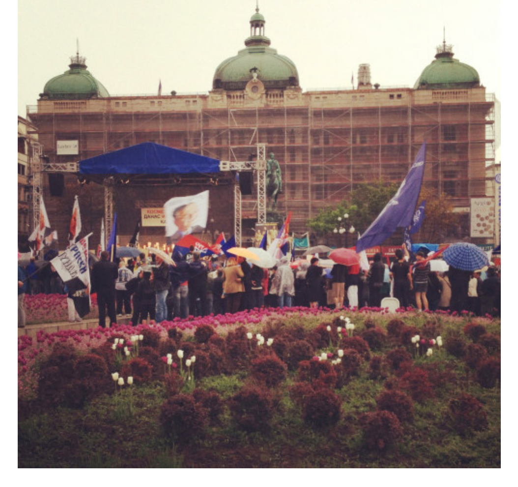
A small anti-EU demonstration at Republic Square.