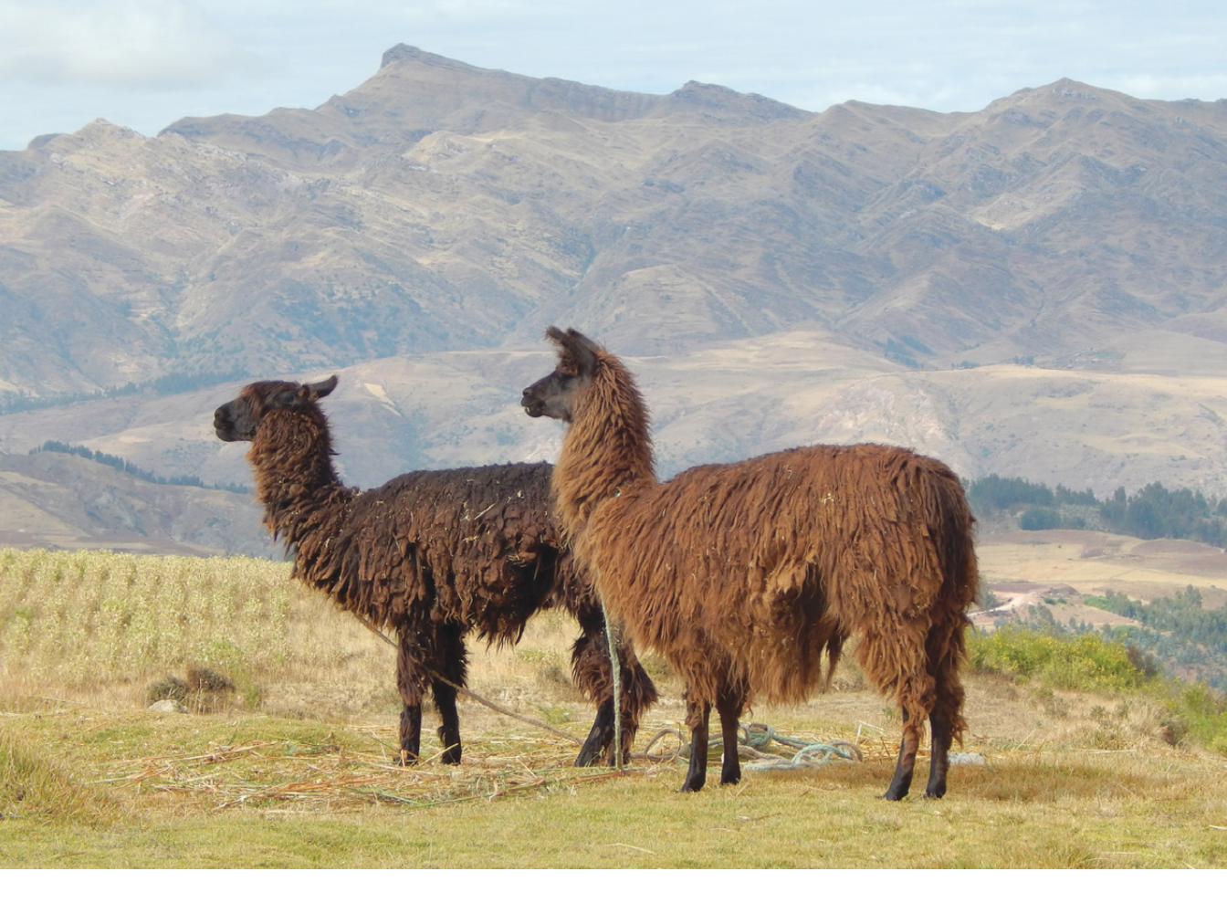
Llamas at the Chinchero market on the way to Machu Picchu.