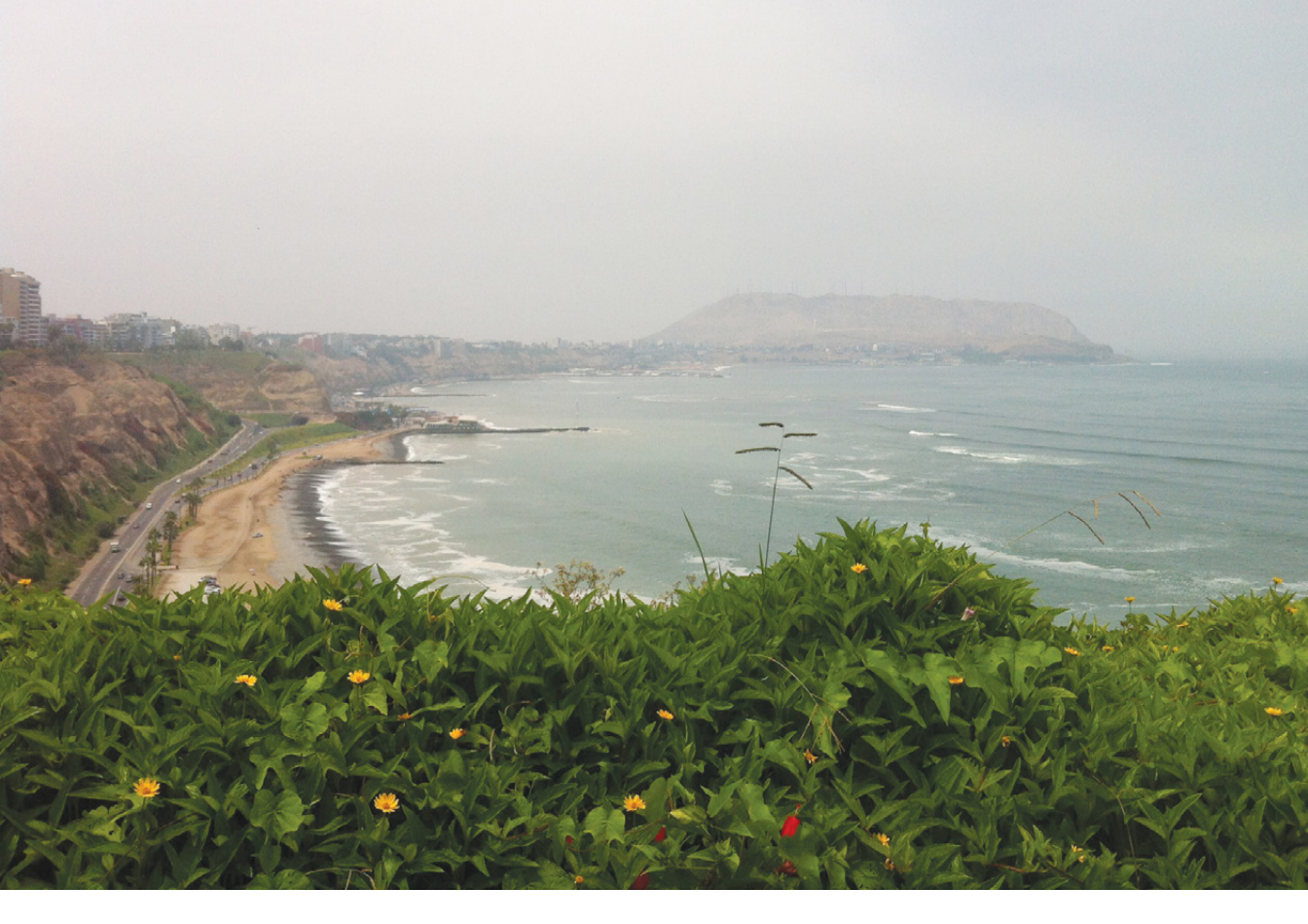
Fog over Lima's coast is almost a daily sight.