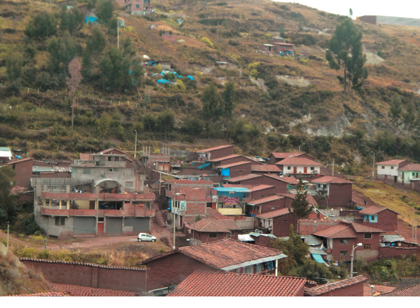
One of the many 'shanty towns' in Peru.